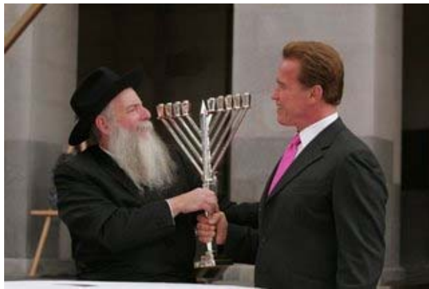
Governor of California, Arnold Schwarzenegger

...Meeting with representatives of the Zionist Lubavitch Movement.